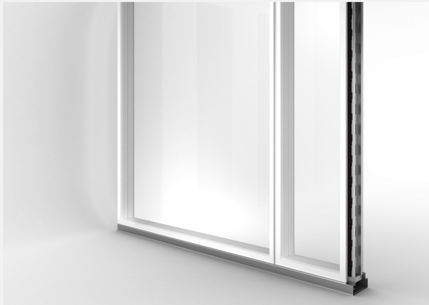
Glazing Multiclean LVT 437